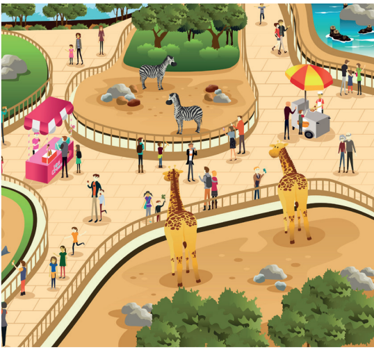
A Day At The Zoo